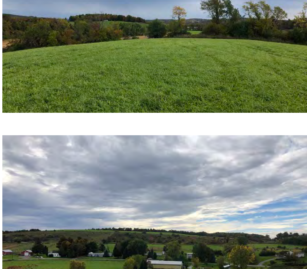
Photo 11 View south from Station 2 (photograph taken October 4, 2022).