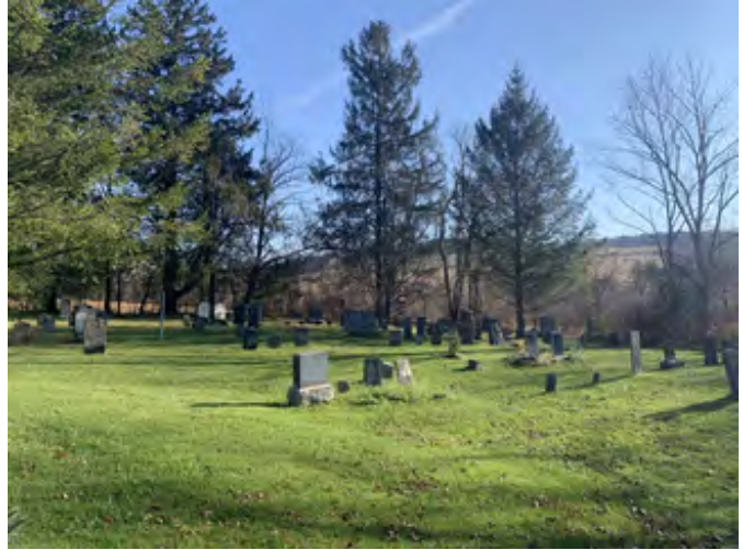
General view of cemetery