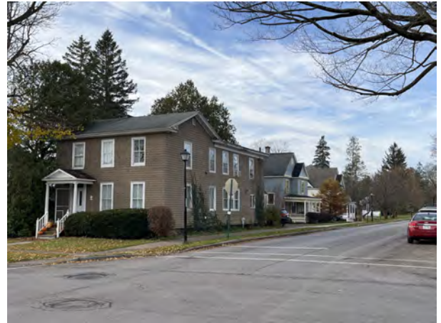
Sullivan Street at Green Street, view northeast