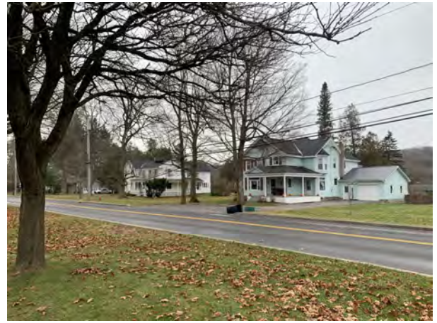
Eaton Street, view southwest