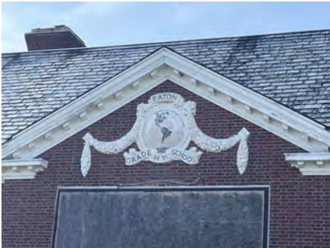
Eaton Grade School, signage, looking southwest

Disclaimer: The Trekker data on this form has not yet been reviewed or approved by NYS OPRHP staff.