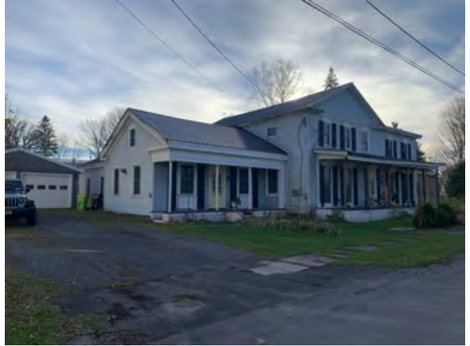
East and north elevations