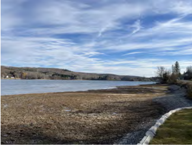
NYS Canal System: Erieville Reservoir & Dam, looking southeast