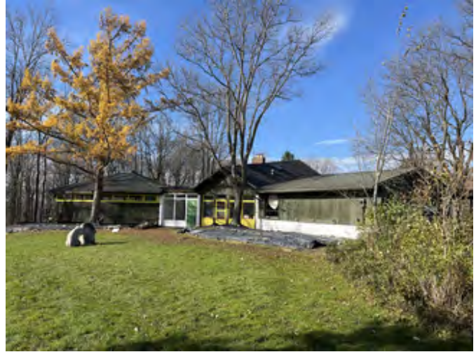
Dorothy Riester House and Studio (aka Hilltop), primary dwelling, facing northwest