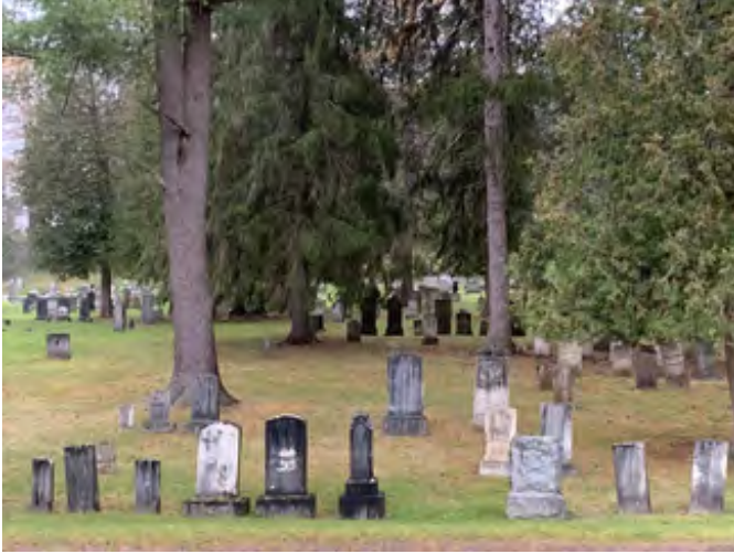
Evergreen Cemetery, representative view of nineteenth-century gravestones