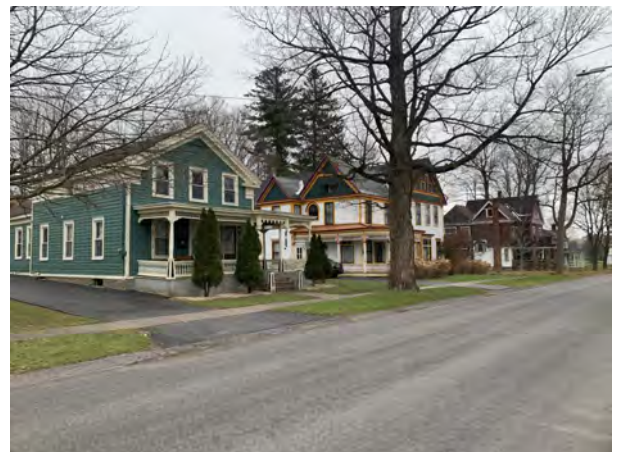
Union Street, view southeast