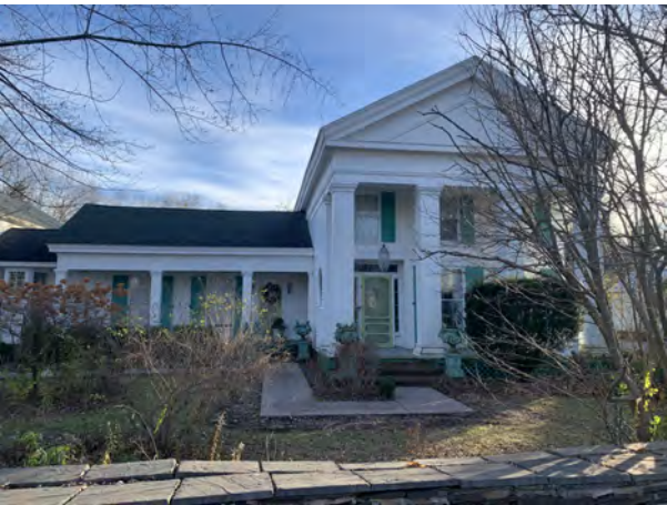
4694 Park Street, view south