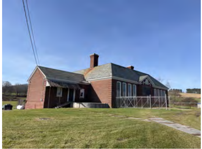
Eaton Grade School, looking northwest