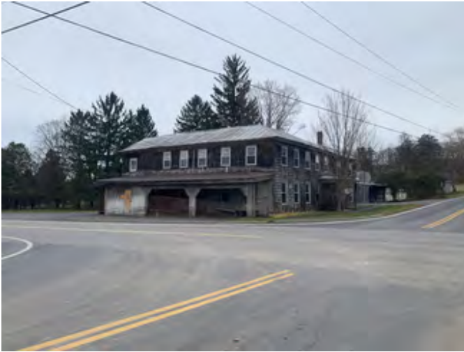
West and south elevations