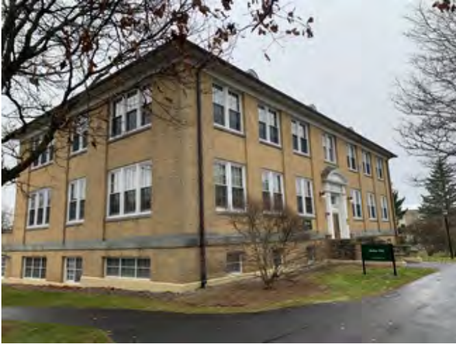
East and north elevations