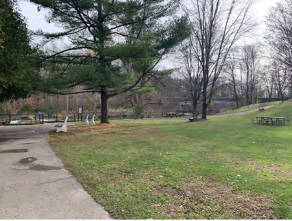
View east towards gorge