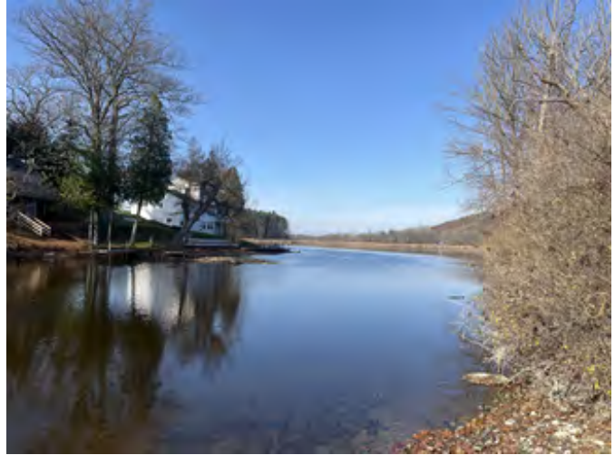
View across Leland Pond