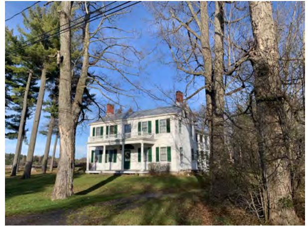
5322 Oxbow Road, view northeast