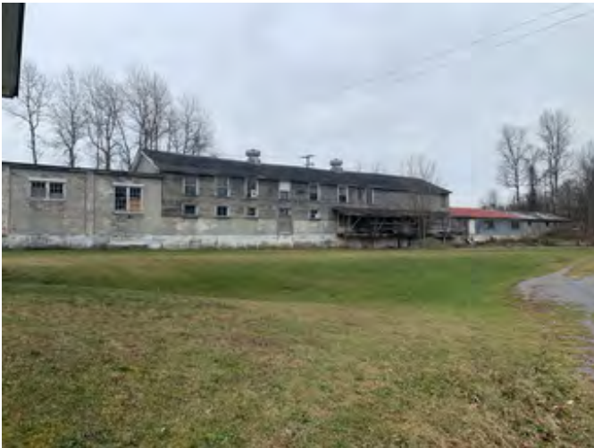
Eaton Station, chicken house, looking northwest