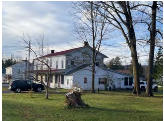
View facing northwest