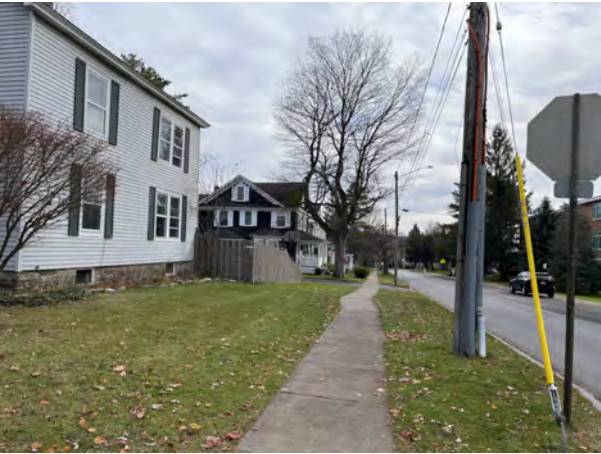
Sullivan Street at Nickerson Street, view east