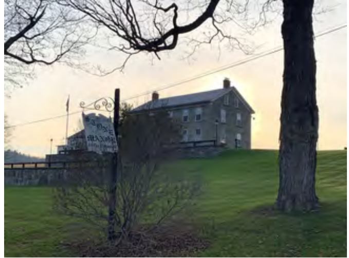
North and east elevations