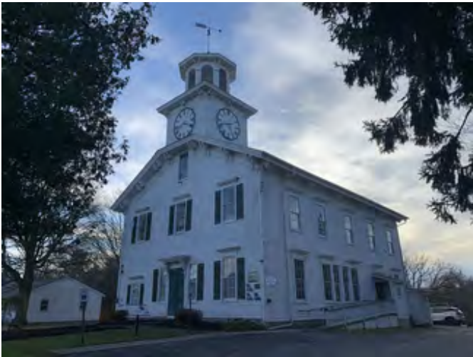
East and north elevations

Disclaimer: The Trekker data on this form has not yet been reviewed or approved by NYS OPRHP staff.