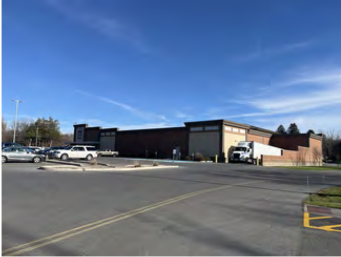
West elevation of new grocery store.