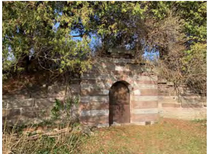
Vault, view north

Disclaimer: The Trekker data on this form has not yet been reviewed or approved by NYS OPRHP staff.