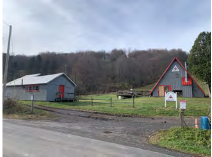
View west towards lift towers and cable in background