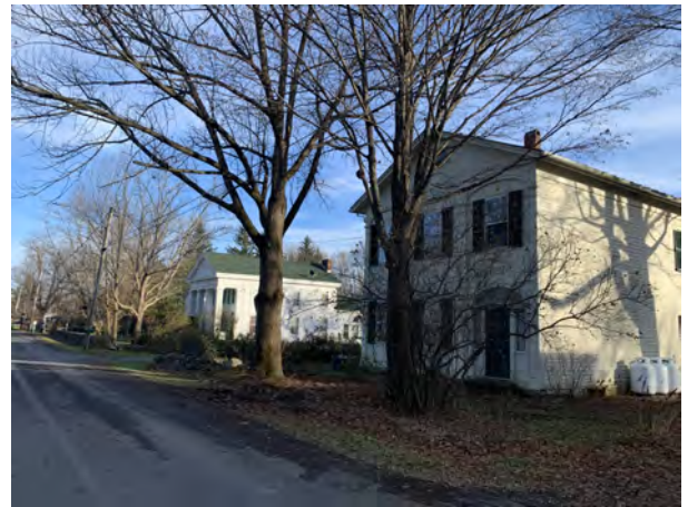
4694 and 4690 Park Street, view southeast