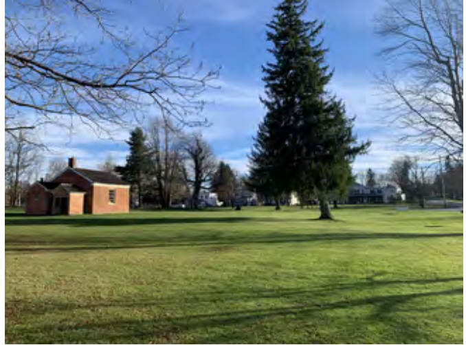
North and west elevations