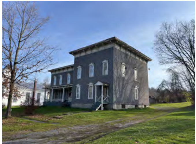
North and west elevations