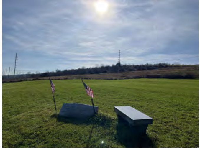
Poor Farm Cemetery, overview, looking southwest