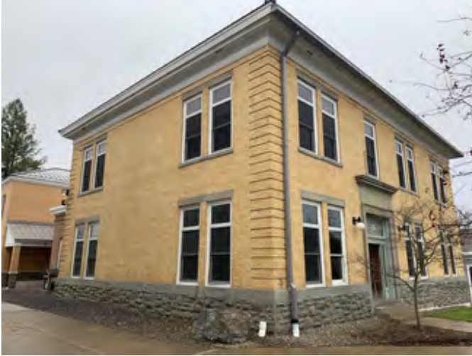
North and east elevations