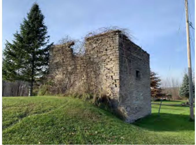
South and east elevations