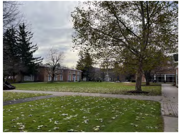
Campus Quad, view southeast