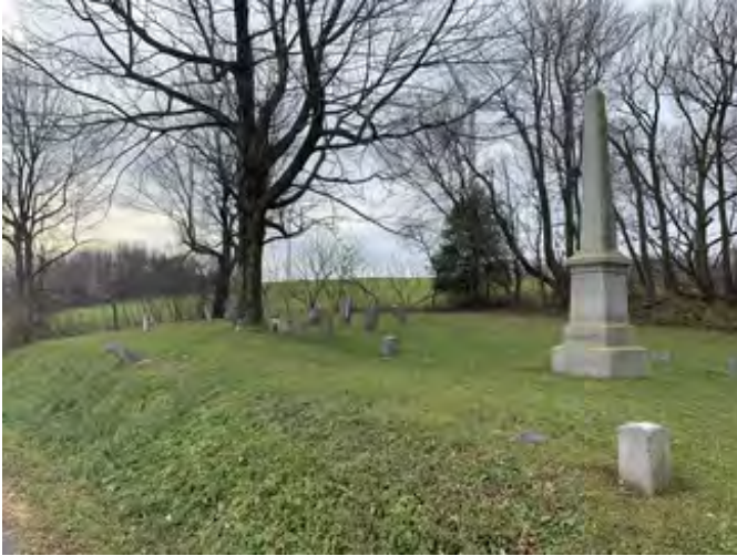
South end of cemetery