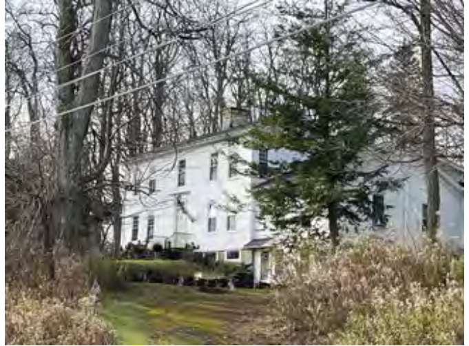
Niles Farmhouse, facing southwest