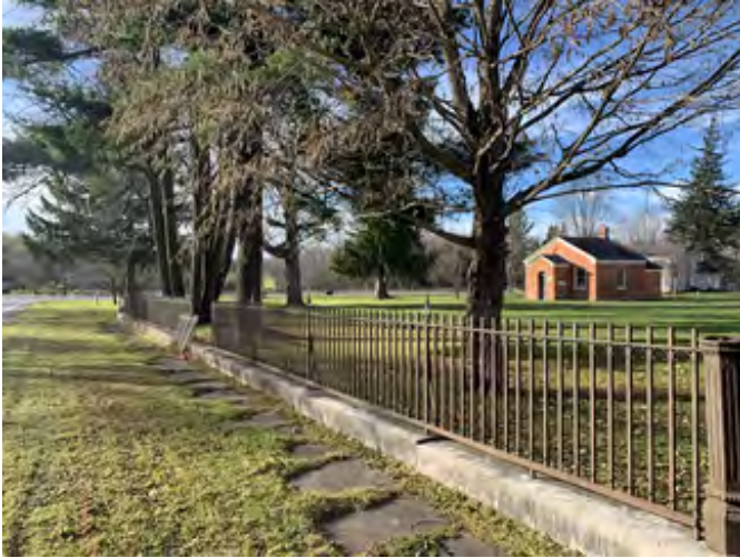
Fence and Peterboro Land Office, view northwest