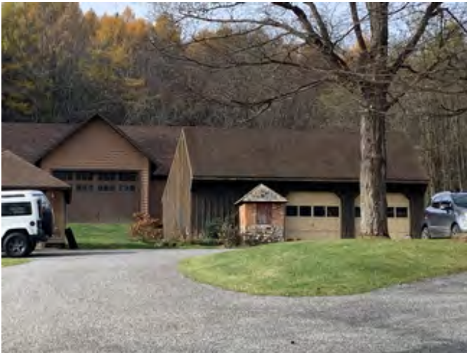
Nichols House, outbuildings, looking west

Disclaimer: The Trekker data on this form has not yet been reviewed or approved by NYS OPRHP staff.