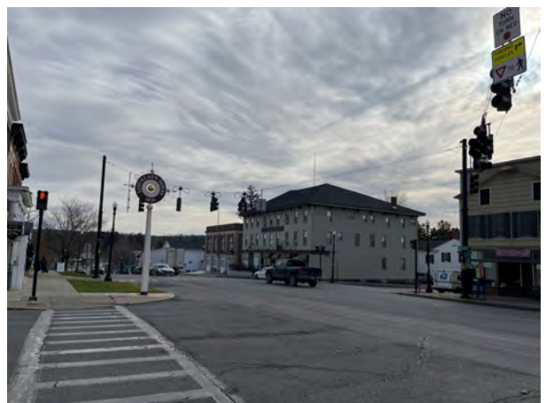
View toward intersection of Albany Street and