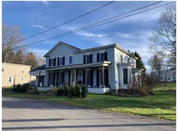
North and west elevations

Disclaimer: The Trekker data on this form has not yet been reviewed or approved by NYS OPRHP staff.