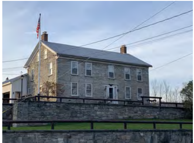
South and east elevations

Disclaimer: The Trekker data on this form has not yet been reviewed or approved by NYS OPRHP staff.