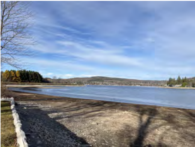
NYS Canal System: Erieville Reservoir & Dam, looking northeast