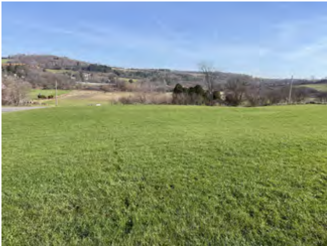
Poor Farm Cemetery, overview, looking southeast