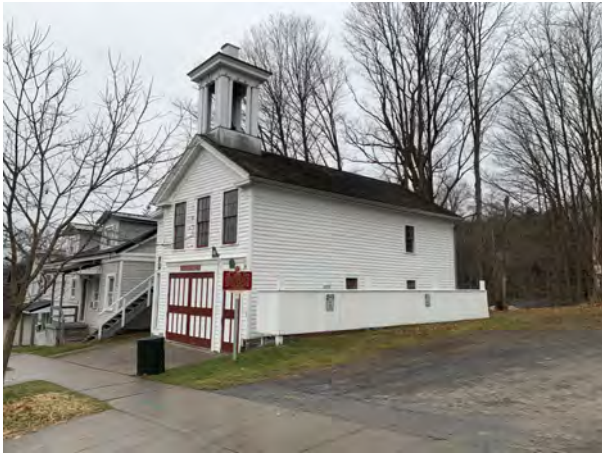
Morrisville Engine House