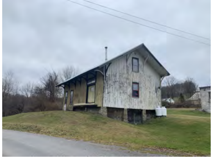
Eaton Station, looking northeast