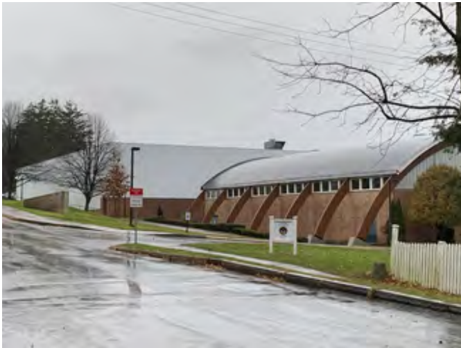
West elevation and later addition

Disclaimer: The Trekker data on this form has not yet been reviewed or approved by NYS OPRHP staff.