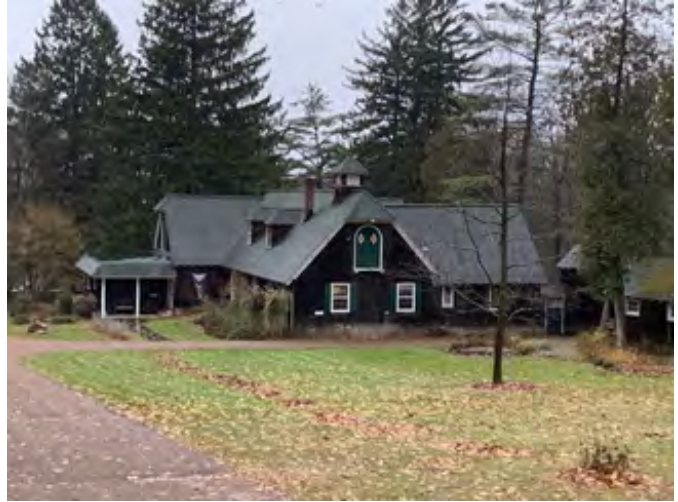
Carriage house, view west