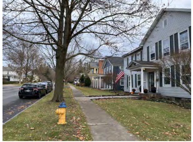
Sullivan Street at Nickerson Street, view south