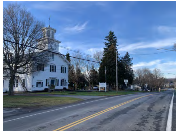
Smithfield Presbyterian Church, view north