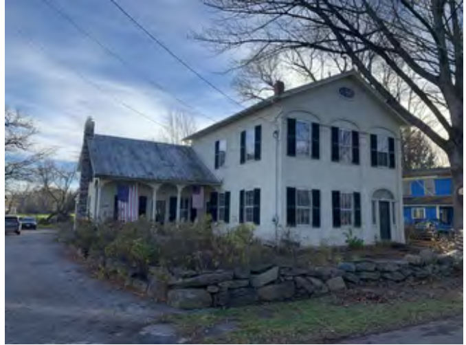
East and north elevations