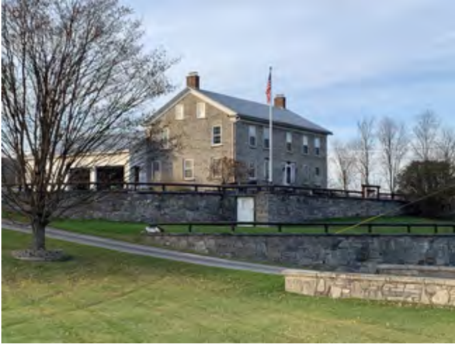
South and east elevations with terracing