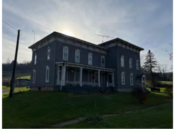
East and north elevations