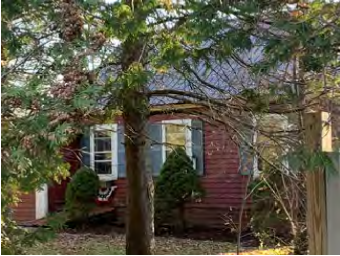
Detail of west elevation