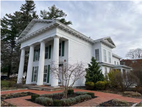
Joy Hall, view northeast