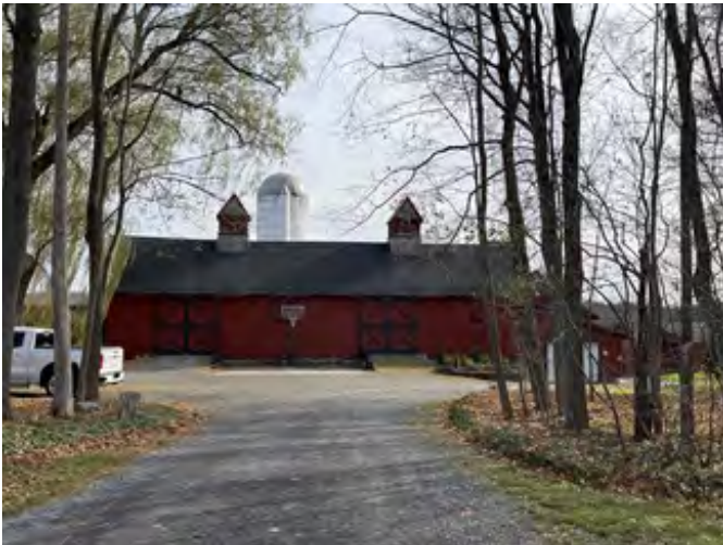
Meadows Farm Complex, dairy barn, facing southeast