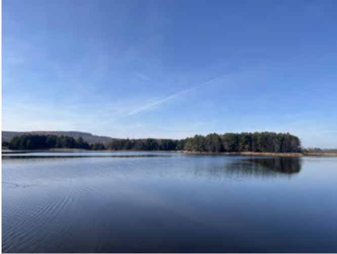
View across Leland Pond