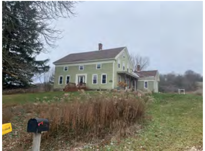
West and north elevations