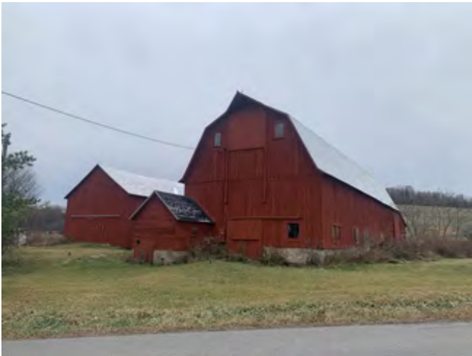
Barn complex, view southwest