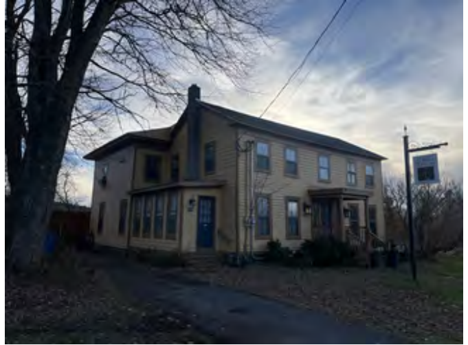
East and north elevations