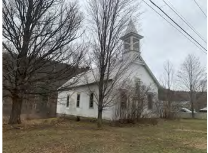
Pinewoods Union Church, looking southeast