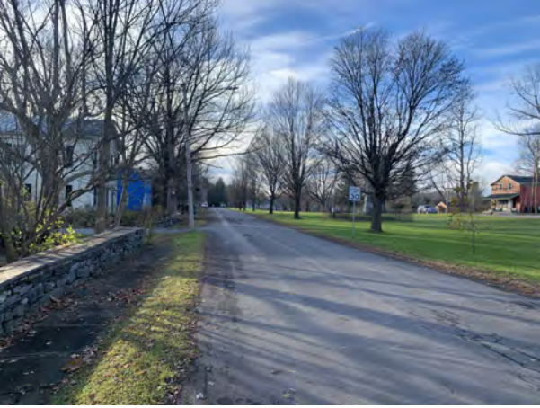
View west along Park Street