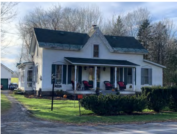
5313 Oxbow Road, view west