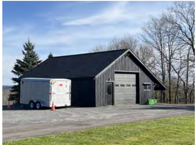
Dorothy Riester House and Studio (aka Hilltop), shed, facing southeast

Disclaimer: The Trekker data on this form has not yet been reviewed or approved by NYS OPRHP staff.