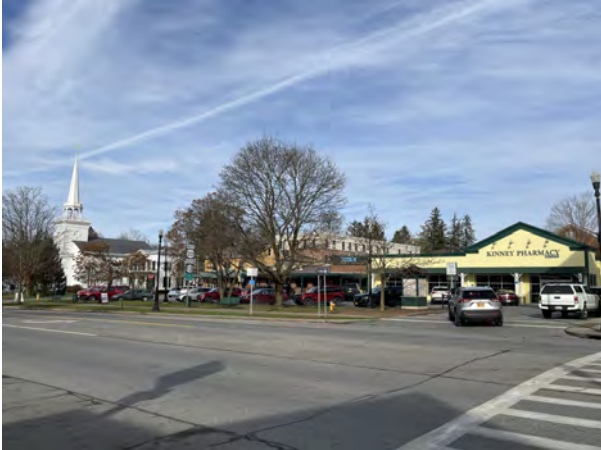
Albany Street at Memorial Park, view northwest

Boundary Justification Sources/Bibliography Streetscapes