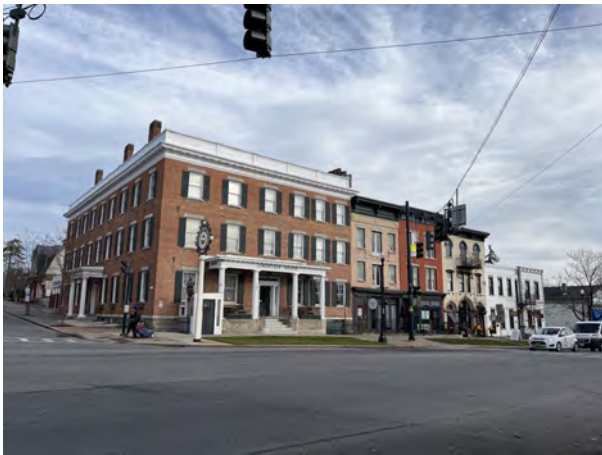
Albany Street at Lincklaen Street, view northeast