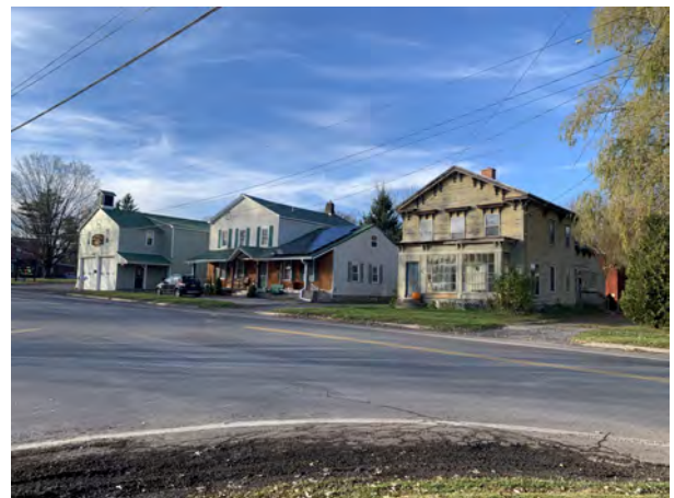
4581-4593 Peterboro Road, view northwest