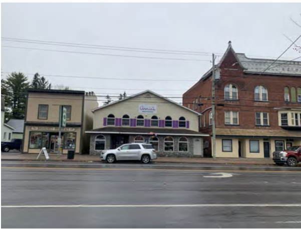
Main Street, view south