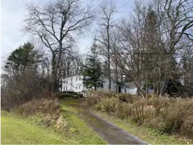
Niles Farmhouse, facing southwest