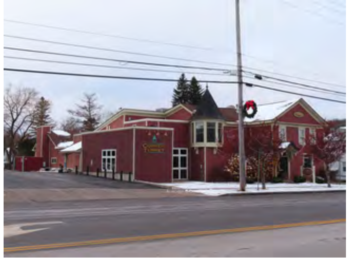
East and north elevations