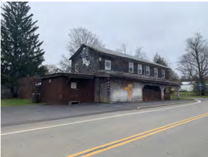
North and west elevations

Disclaimer: The Trekker data on this form has not yet been reviewed or approved by NYS OPRHP staff.