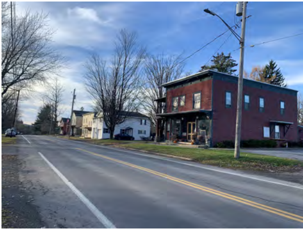
View northwest along Main Street