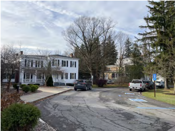
Albany Street at Memorial Park, view southwest