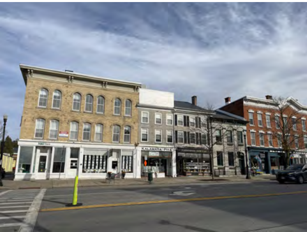
43-59 Albany Street, view northeast