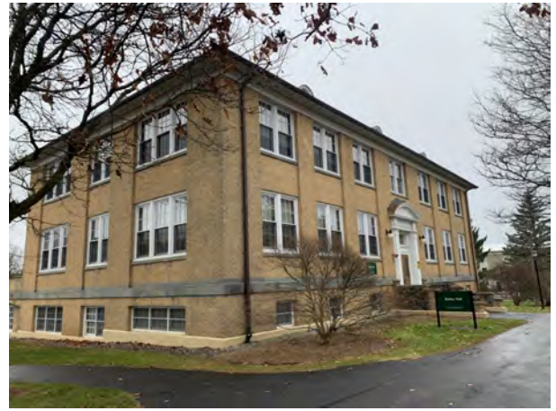
Bailey Hall, view southwest