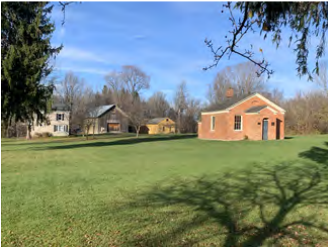
Lodge, barn, laundry, and Peterboro Land Office; view northeast