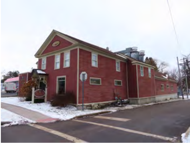
North and west elevations