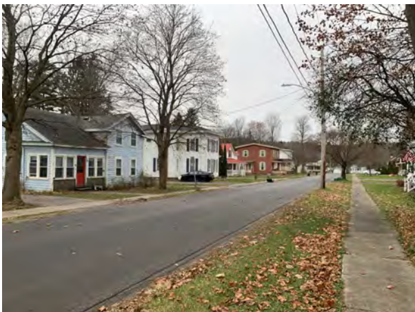
East Maple Avenue, view west