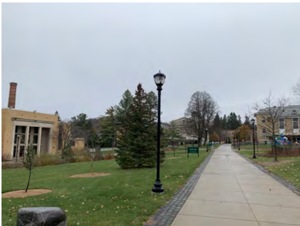
View north towards Hamilton Hall, Bicknell Hall, Madison Hall, and Bailey Hall