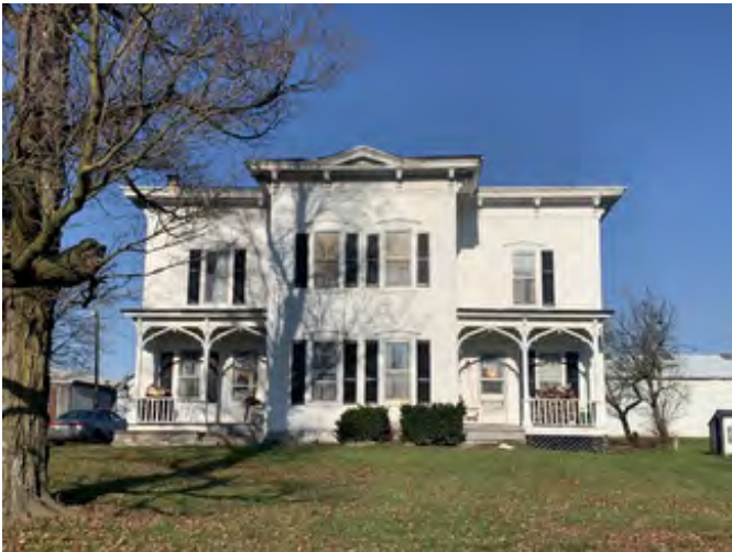
Residence, facing northwest