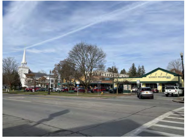
Albany Street at Memorial Park, view north