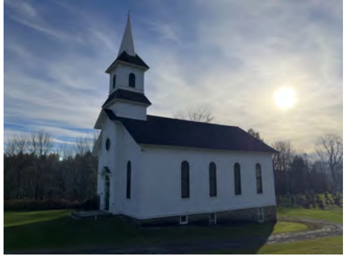
East and north elevation