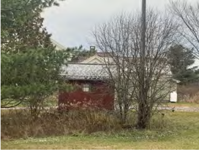
Shed, view south