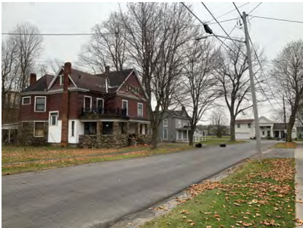
Union Street, view southeast