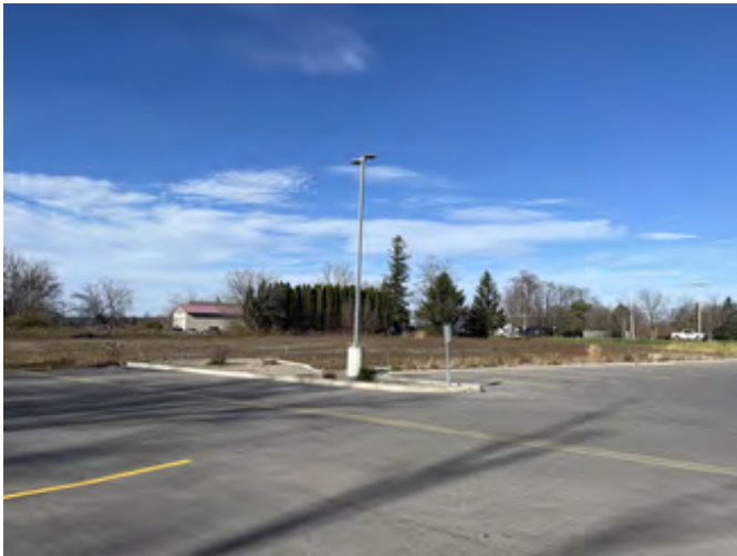
Parking lot, facing west.