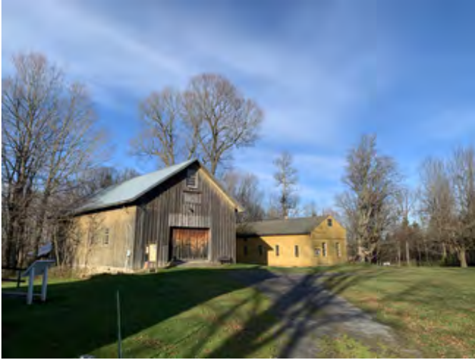
Barn and Laundry; view northeast