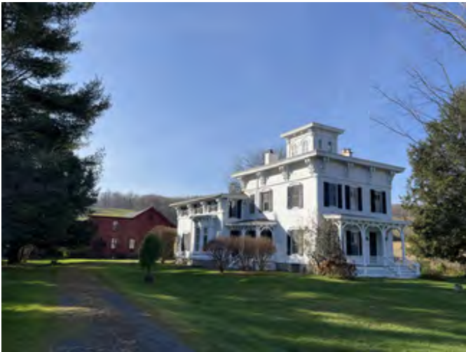
Smith House, facing west