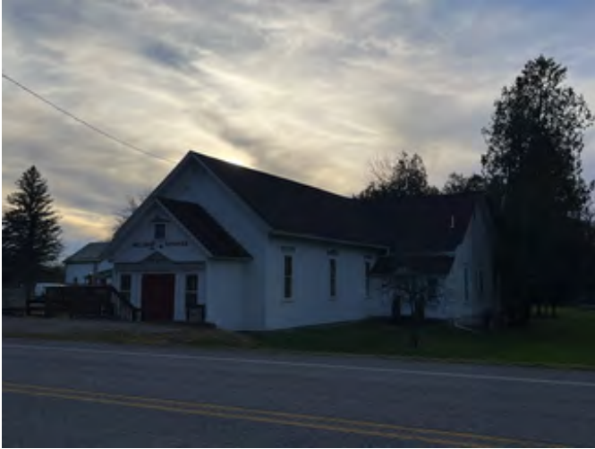
Nelson Grange No. 1271, looking southwest