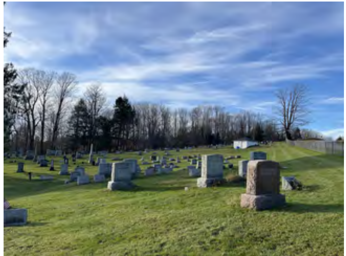
Welsh Church Cemetery facing north