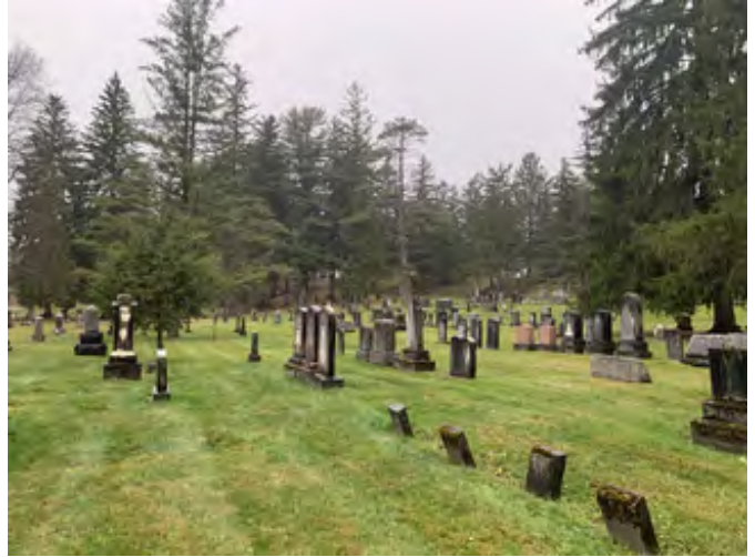
Evergreen Cemetery, looking northwest