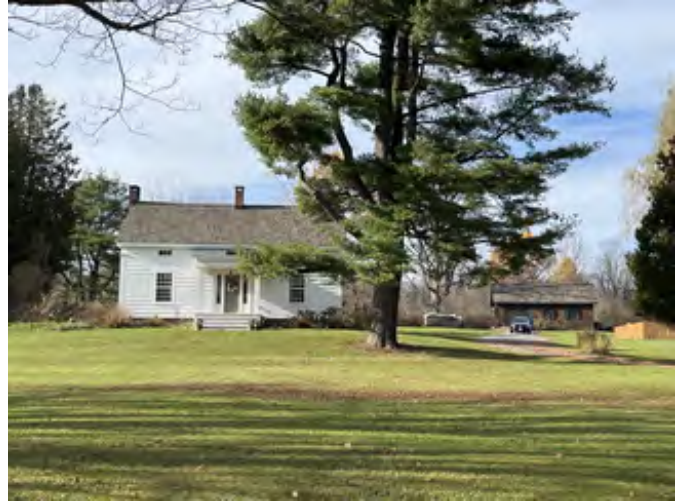
Case House, facing northwest