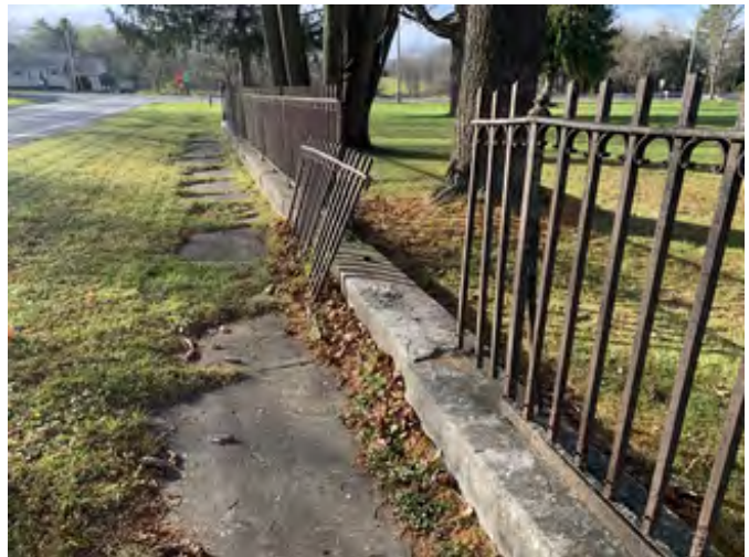
Iron fence, view northwest

Disclaimer: The Trekker data on this form has not yet been reviewed or approved by NYS OPRHP staff.