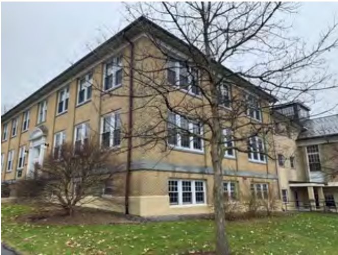
North and west elevations