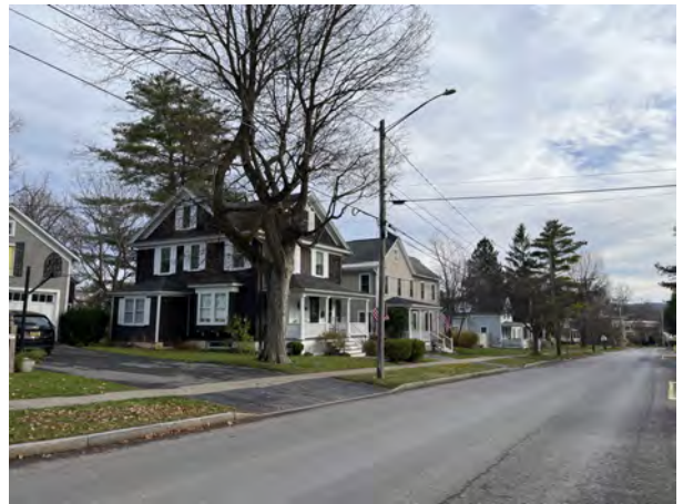
Nickerson Street looking toward Liberty Street, view east