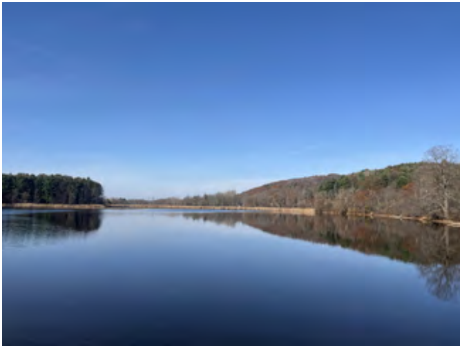
View across Leland Pond

Disclaimer: The Trekker data on this form has not yet been reviewed or approved by NYS OPRHP staff.