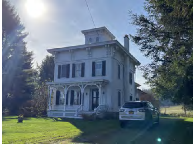
Smith House, facing southwest