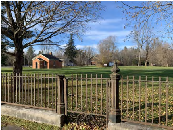
Gerrit Smith estate, view northwest