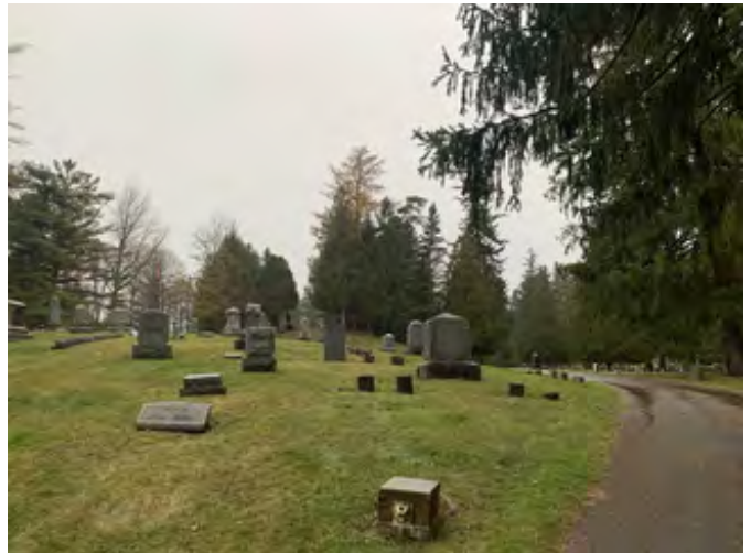
Evergreen Cemetery, representative view

Disclaimer: The Trekker data on this form has not yet been reviewed or approved by NYS OPRHP staff.