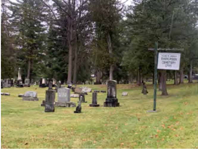
Evergreen Cemetery, looking northeast