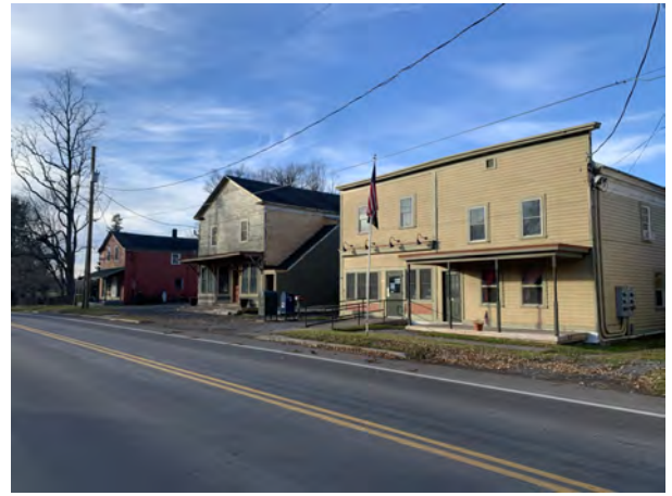
View northwest along Main Street