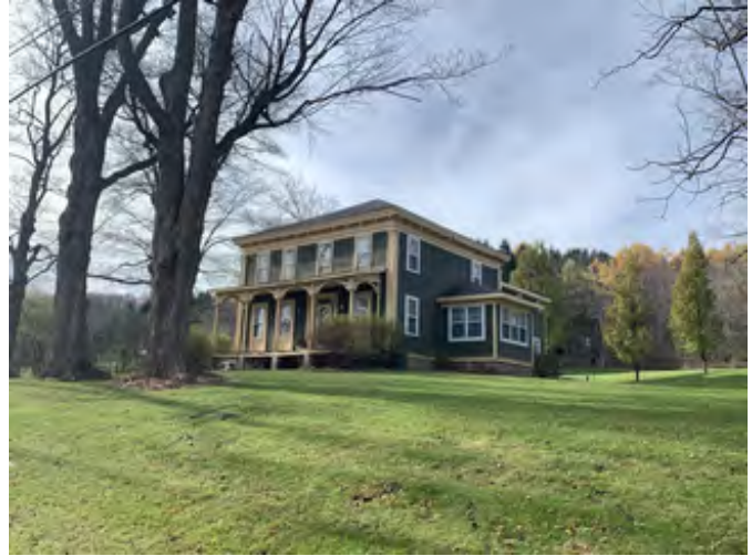
Nichols House, looking southwest