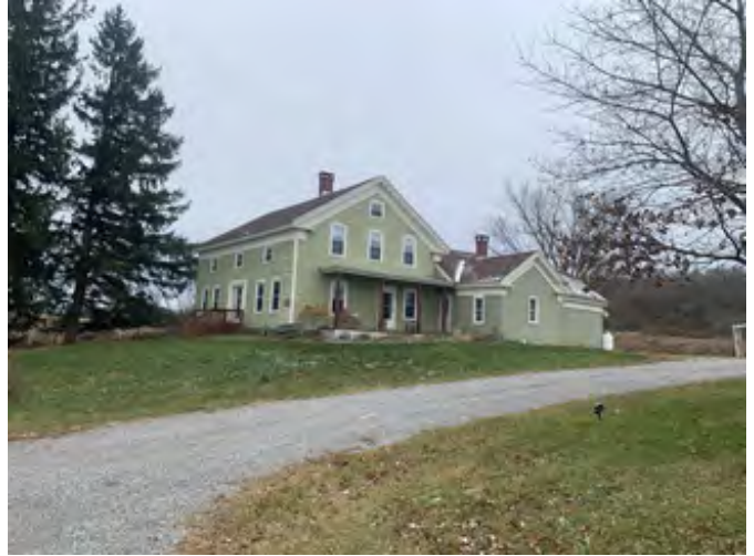
West and north elevations