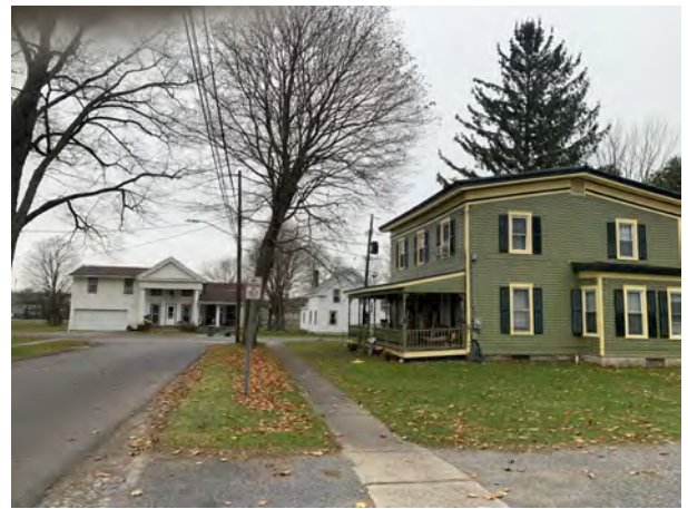
Union Street, view south