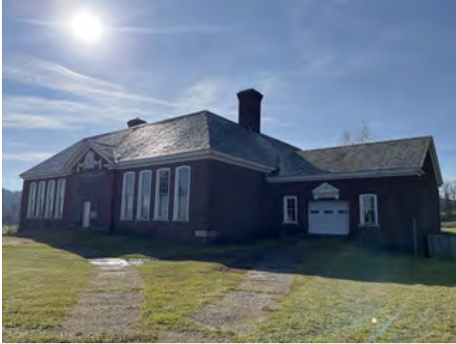
Eaton Grade School, looking southwest