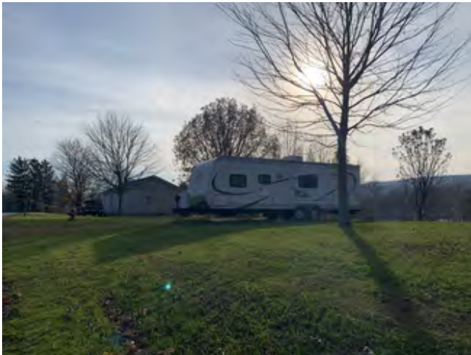
Non-historic residence on property