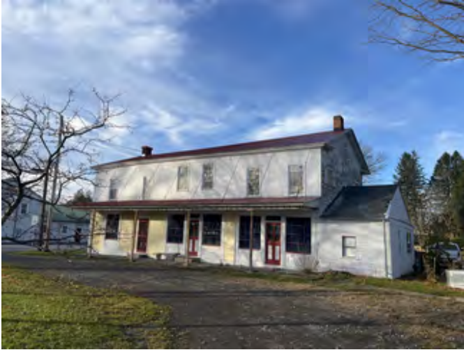
View facing northwest