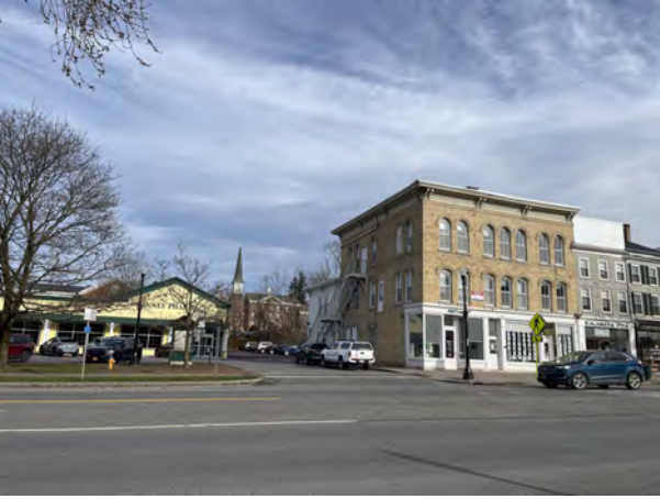
43 Albany Street, view northeast