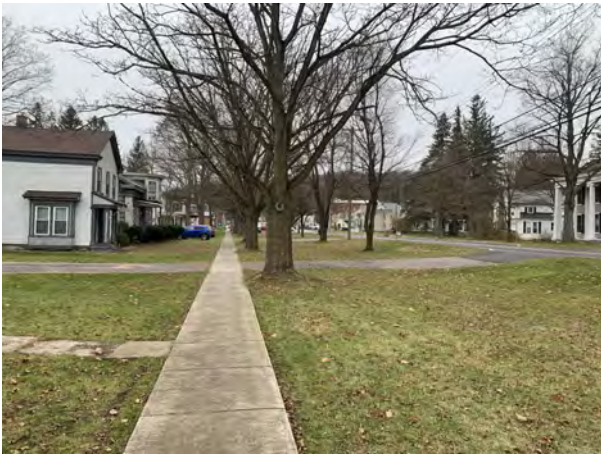
Eaton Street "village green," view north