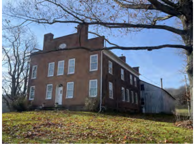
Moseley-Kellogg House, facing southwest