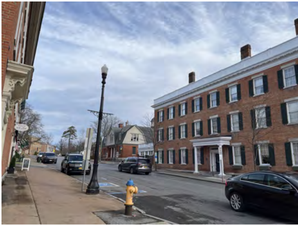
Linklaen Street at Albany Street, view northeast