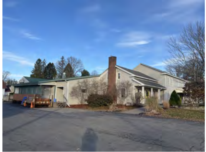
West and south elevations