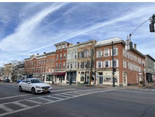
Northwest quadrant of intersection of Albany