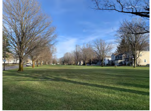
View east along village green