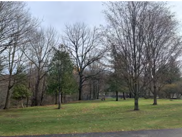
View southeast towards gorge