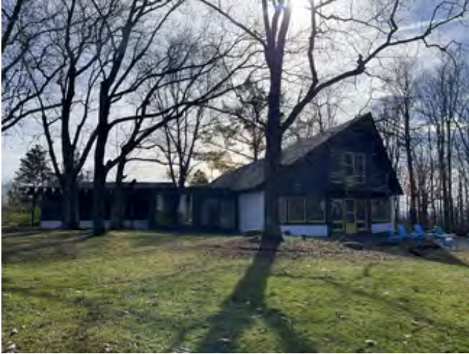
Dorothy Riester House and Studio (aka Hilltop), primary dwelling, facing southwest