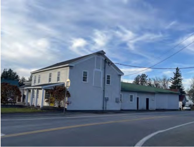
South and east elevations