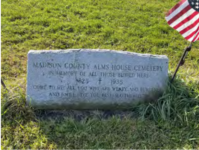
Poor Farm Cemetery, monument, looking southwest