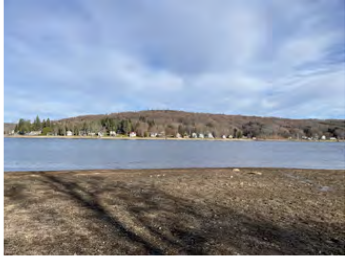
NYS Canal System: Erieville Reservoir & Dam, looking east