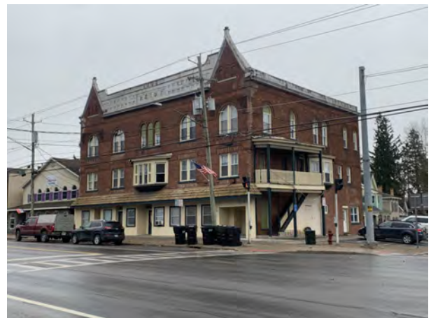
2 East Main Street