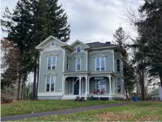
Fountainview, facing east