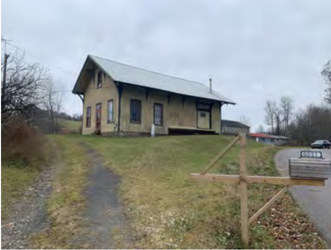
Eaton Station, looking southeast