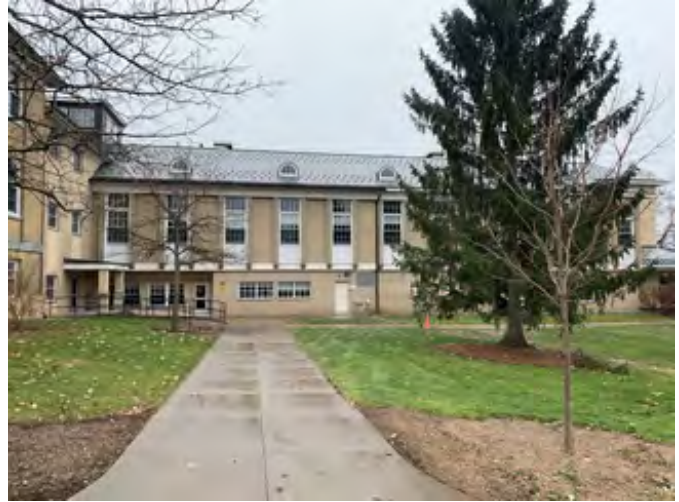
Rear addition, view south