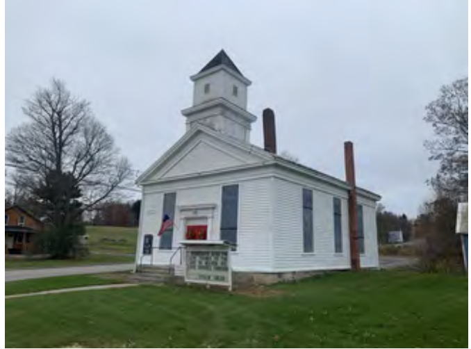
Pratts Hollow United Methodist Church, looking southeast