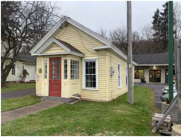
21 East Main Street