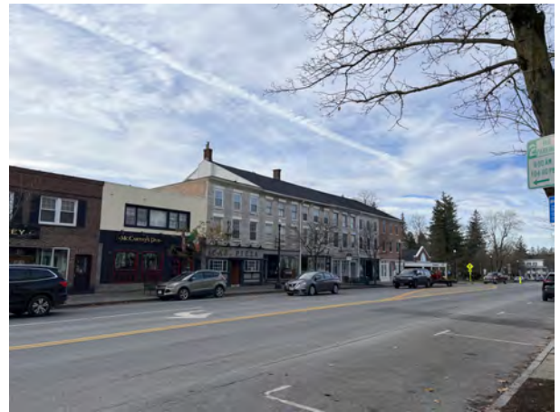
52-64 Albany Street, view southwest