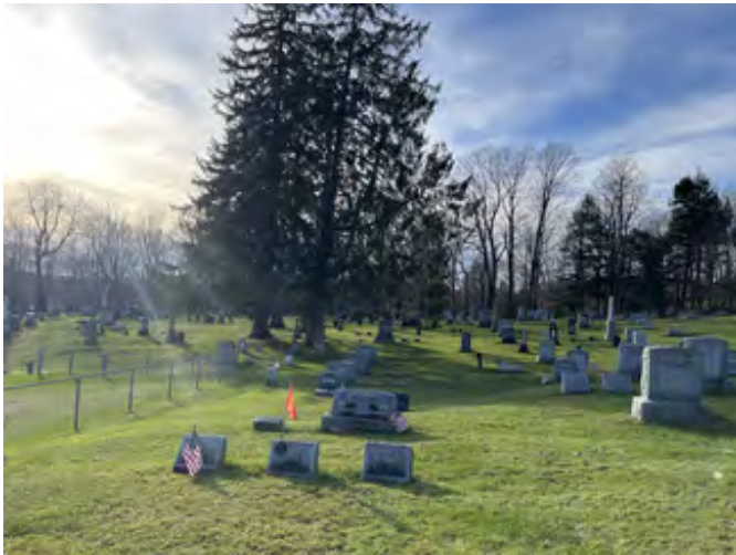
Welsh Church Cemetery facing west