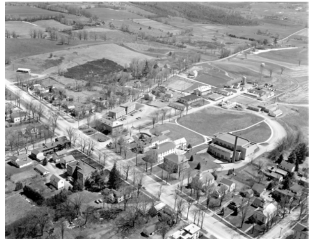
1958 aerial photo