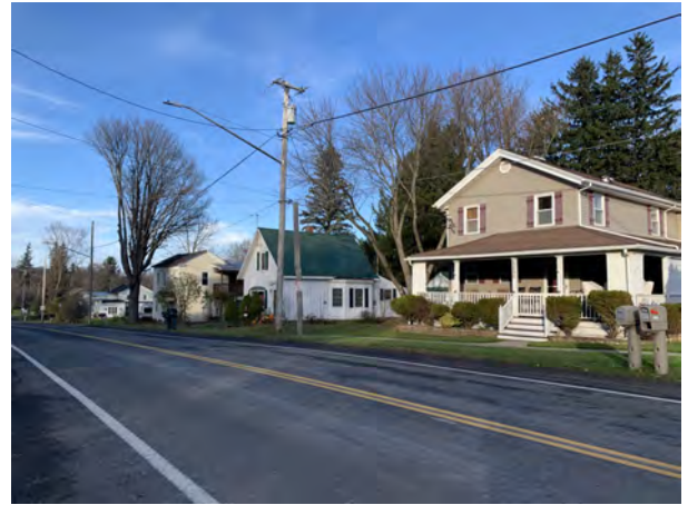
View northeast along Pleasant Valley Road