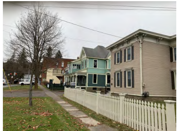
Eaton Street, view north