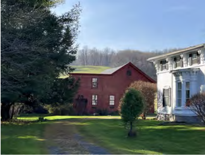
Smith House, barn, facing west