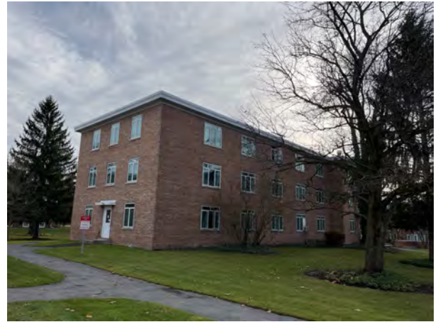
Farber Hall, view southeast