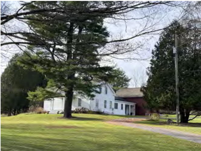
Case House, facing southwest

Disclaimer: The Trekker data on this form has not yet been reviewed or approved by NYS OPRHP staff.