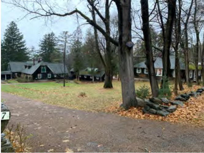
Carriage house and gardener's cottage, view northwest