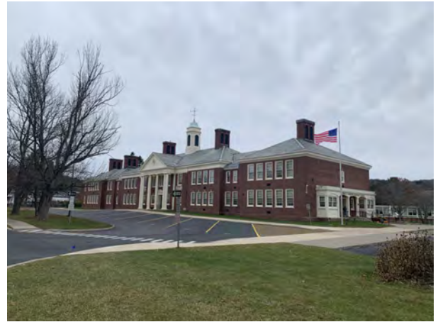
Edward R. Andrews Elementary School