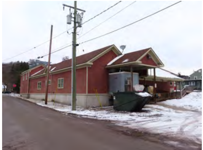
West and south elevations

Disclaimer: The Trekker data on this form has not yet been reviewed or approved by NYS OPRHP staff.