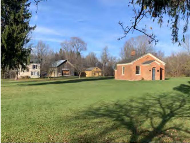
West and south elevation