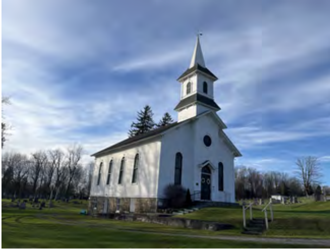
South and east elevation