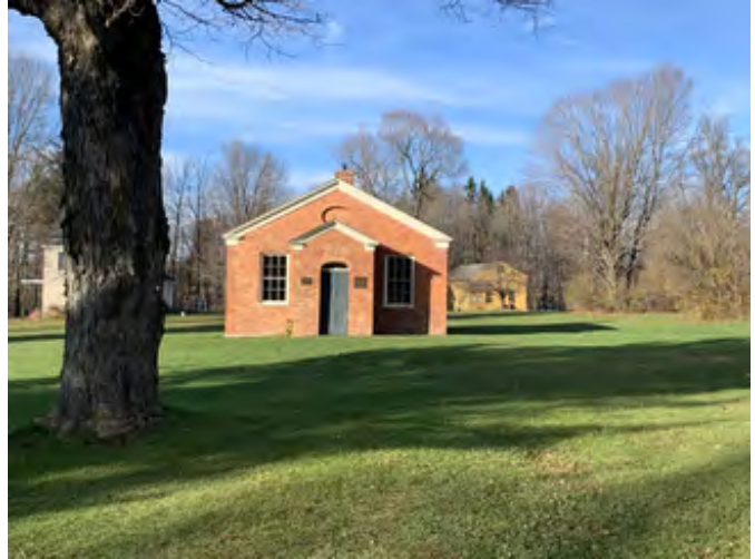
Peterboro Land Office, south elevation