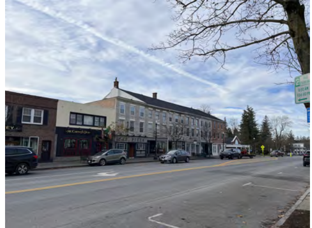
52-66 Albany Street, view southwest