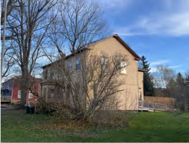
North and west elevations