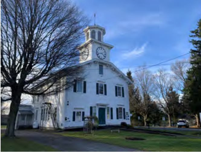
South and east elevations