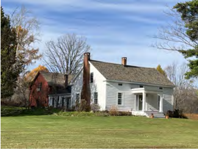
Case House, facing northwest