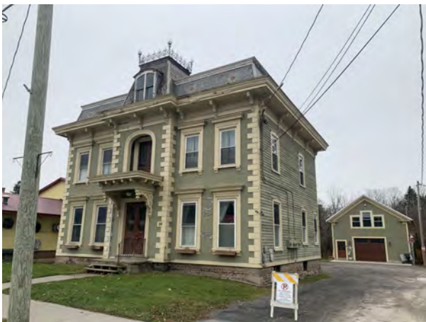
26 East Main Street