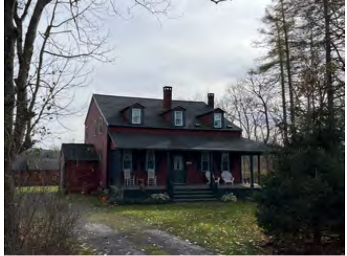
Meadows Farm Complex, c. 1810 guesthouse, facing southeast