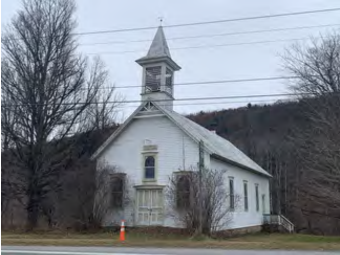
Pinewoods Union Church, looking north