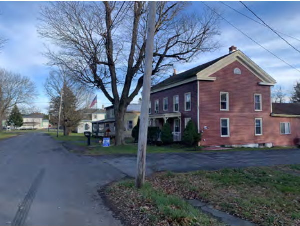
4708 Park Street, view east