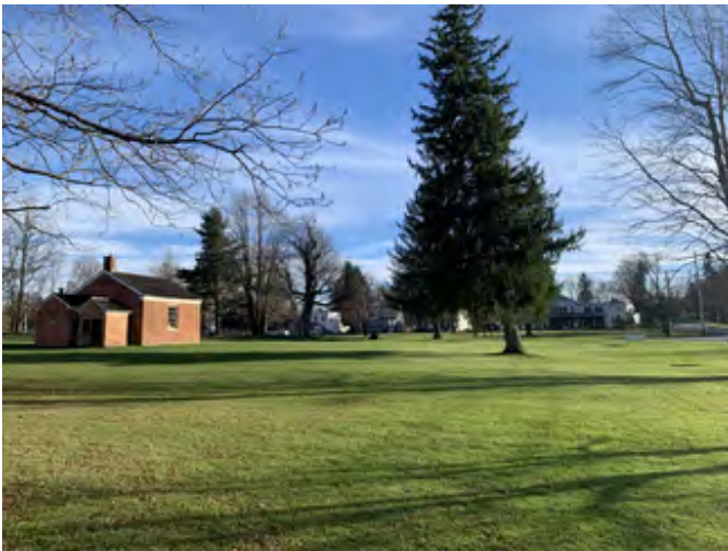
Peterboro Land Office; view southeast