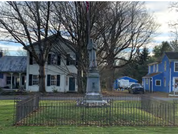
View south, Civil War monument and village green