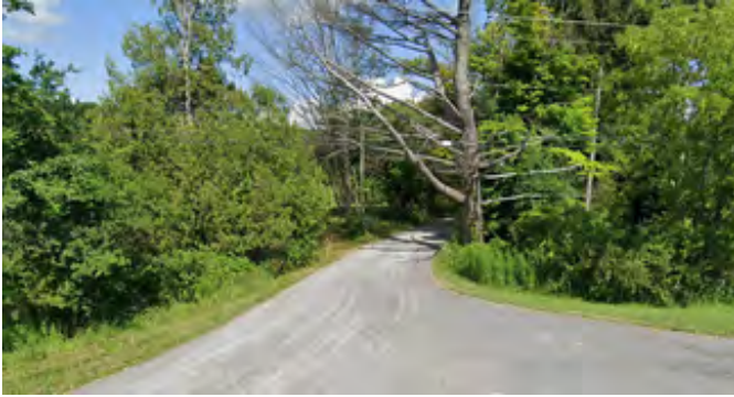
Old Trees, driveway (property not visible from public ROW), looking northwest