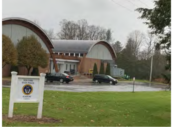
West and south elevations