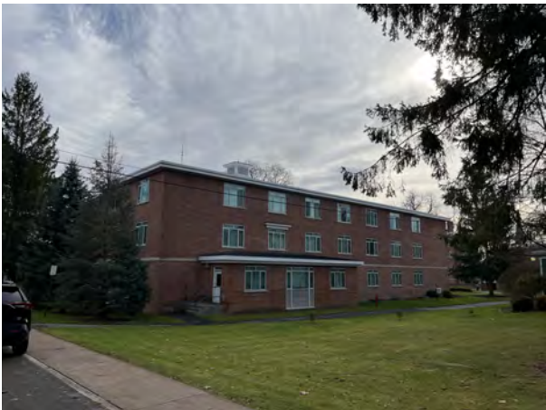
Park Hall, view southeast