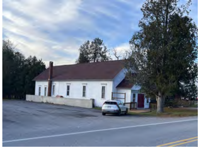
Nelson Grange No. 1271, looking northwest