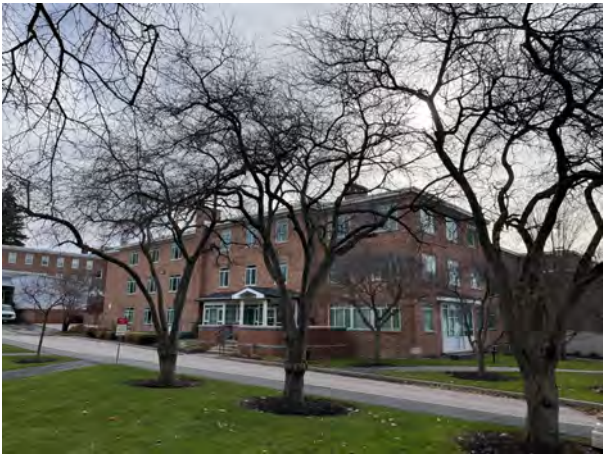
Shove Hall, view southeast