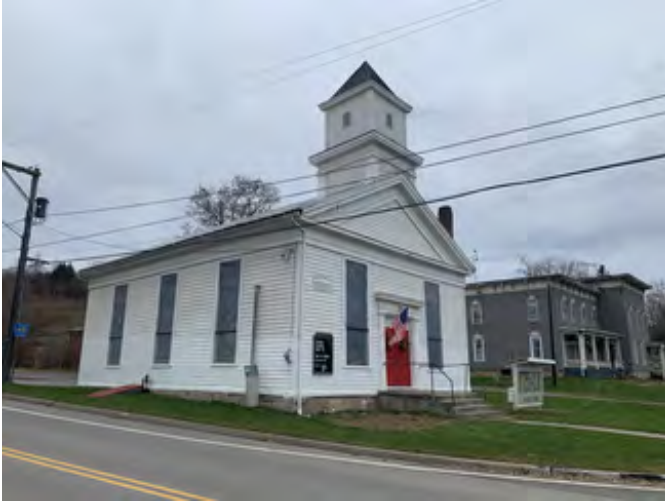
Pratts Hollow United Methodist Church, looking southwest