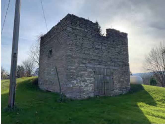
North and east elevations