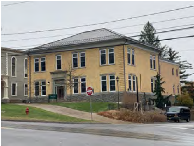
North and west elevations

Disclaimer: The Trekker data on this form has not yet been reviewed or approved by NYS OPRHP staff.