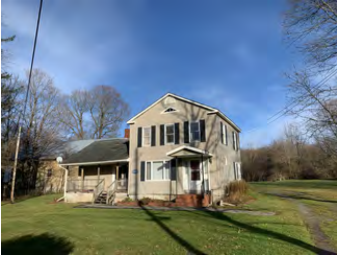
Lodge; view northeast