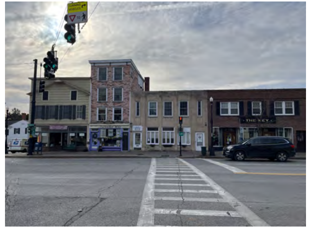
66-76 Albany Street, view south