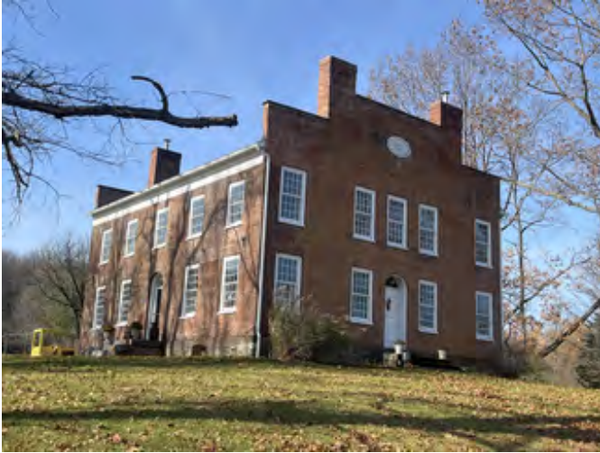
Moseley-Kellogg House, facing northwest