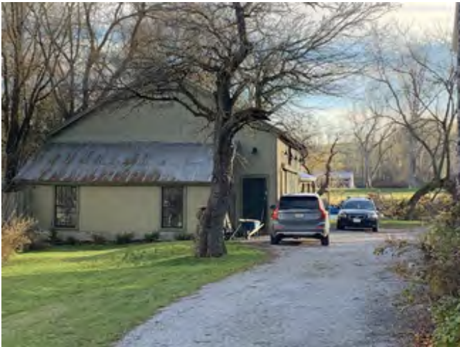
Carriage house, view south