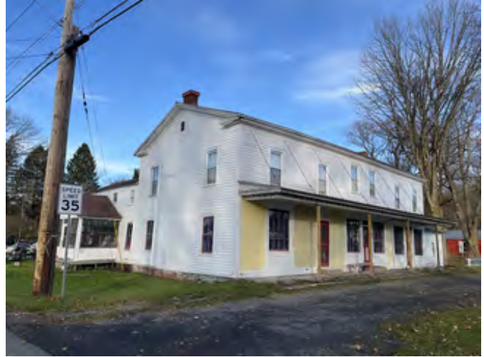
View facing northeast