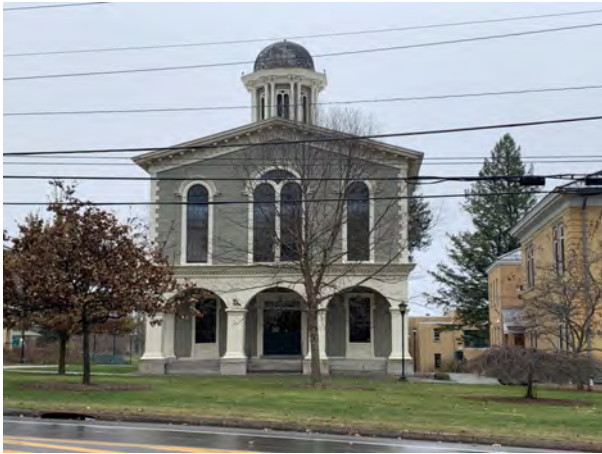
Madison Hall, view south