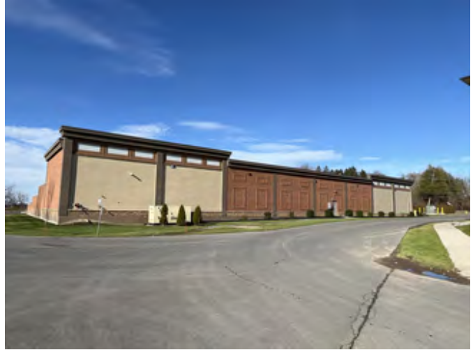
East elevation of new grocery store