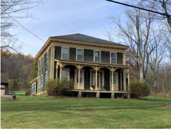
Nichols House, looking northwest