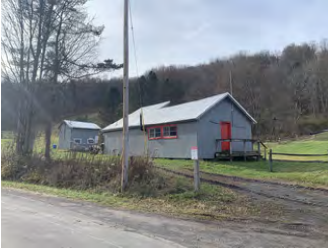
View southwest towards drive station (smaller structure)