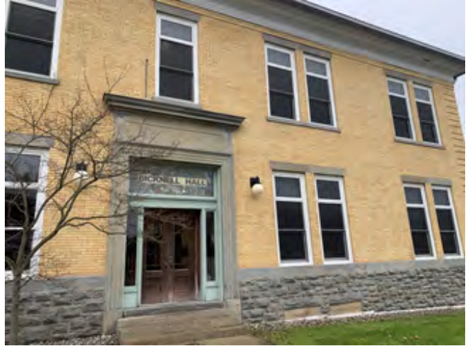
Detail, primary entrance