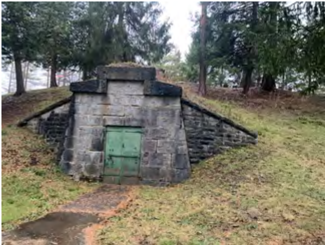
Evergreen Cemetery, mausoleum, looking northeast