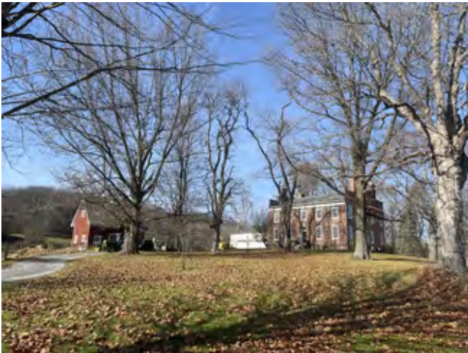
Moseley-Kellogg House, overview, facing northwest