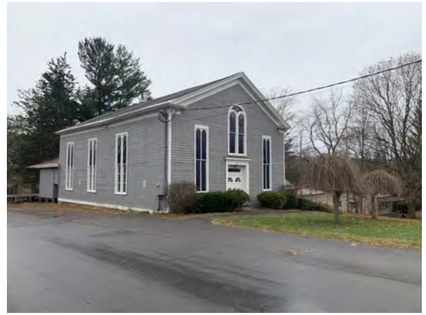
Former Morrisville Methodist Church