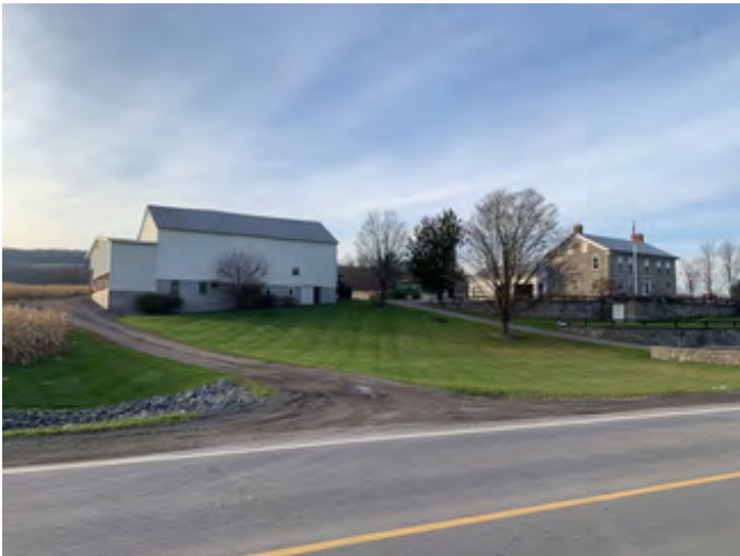
Barn and residence facing northwest