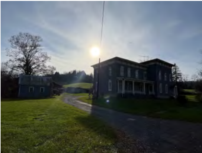
House and sheds