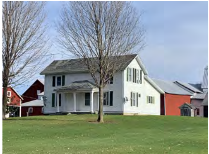
Residence, west and south elevations

Disclaimer: The Trekker data on this form has not yet been reviewed or approved by NYS OPRHP staff.