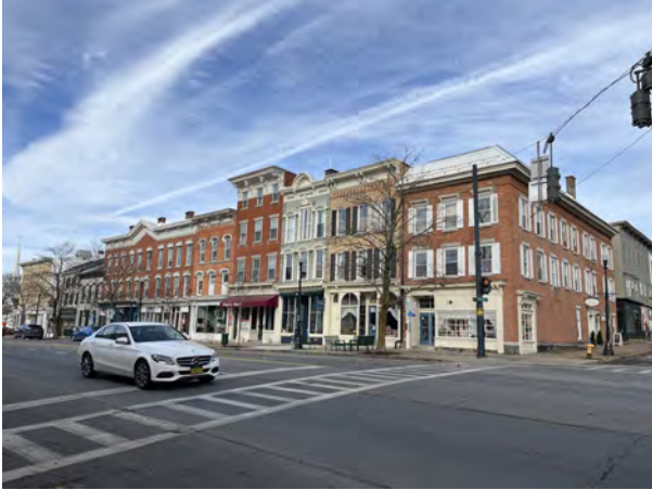
43-69 Albany Street, view southeast