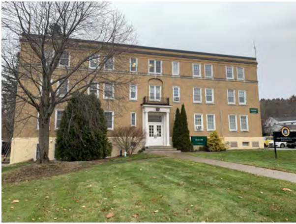
Brooks Hall, view north