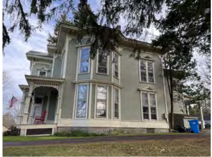
Fountainview, facing north