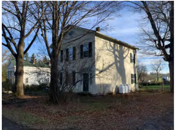
North and west elevations