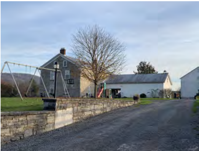
North and west elevations