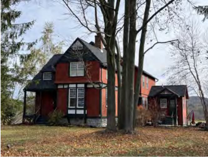
Meadows Farm Complex, primary farmhouse, facing northeast