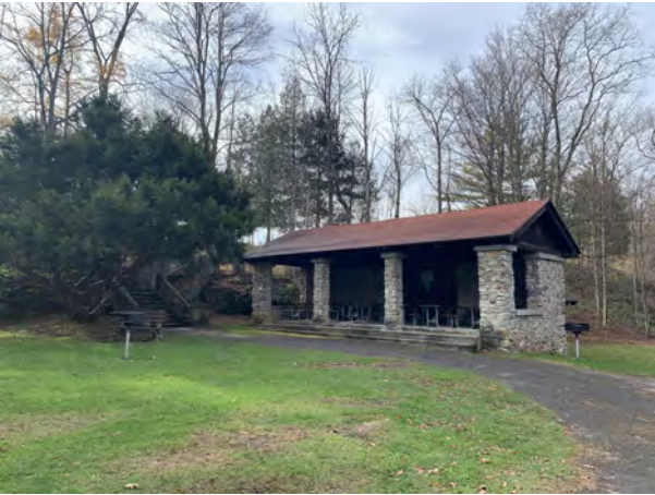
Picnic shelter, view northwest