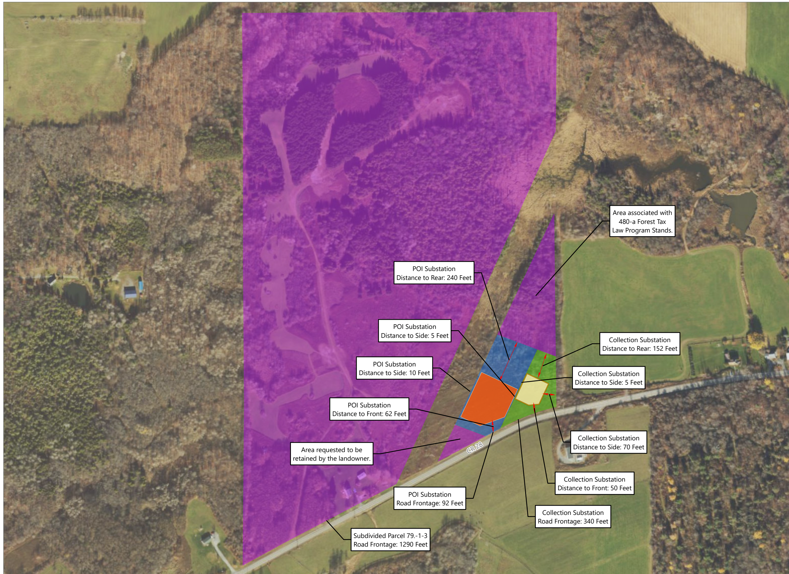
Figure 24-3. Substation Subdivision Setbacks