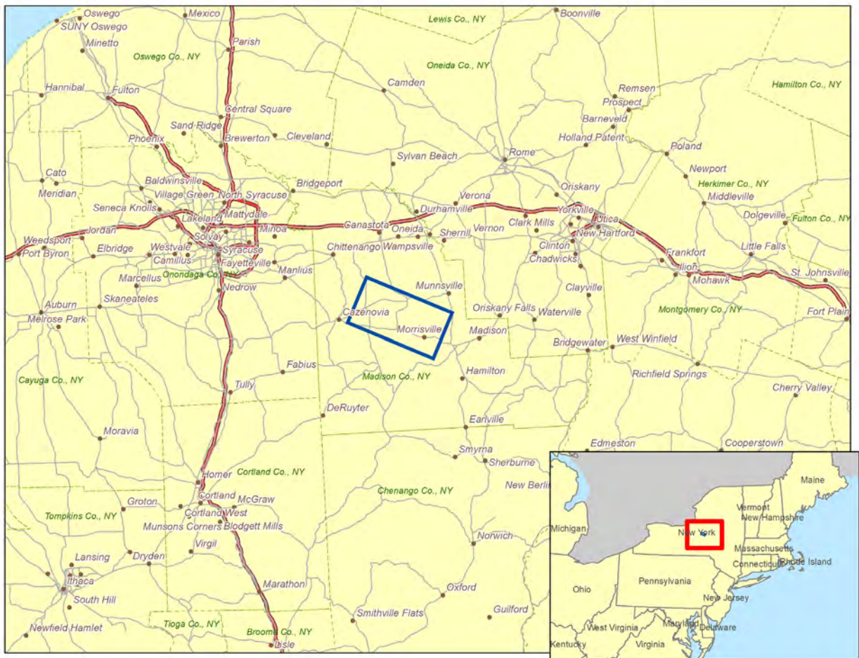
Figure 1: Counties that intersect the Area of Interest

Our mobile phone analysis was performed using Comsearch’s proprietary carrier database, which is derived from a variety of sources including the Federal Communications Commission (FCC). Since mobile phone market boundaries differ from service to service, we disaggregated the carriers’ licensed areas down to the county level. Then we compiled a list of all mobile phone carriers in the main counties that intersect the area of interest. The area of interest was defined by the client and encompasses the planned turbine locations. A depiction of the Project Area and counties appears below.