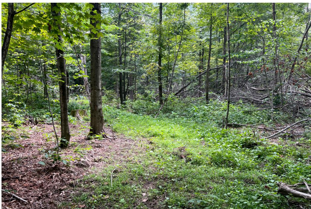
Photo 18 View of forest habitat within sampling hexagon E.