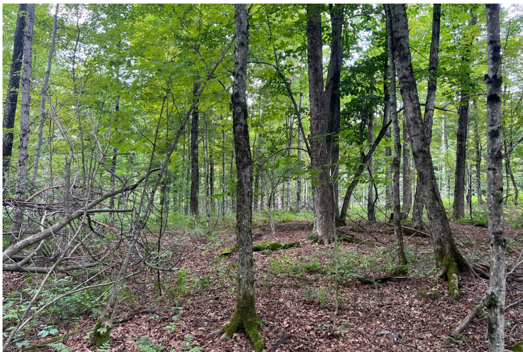
Photo 17 View of forest habitat within sampling hexagon E.