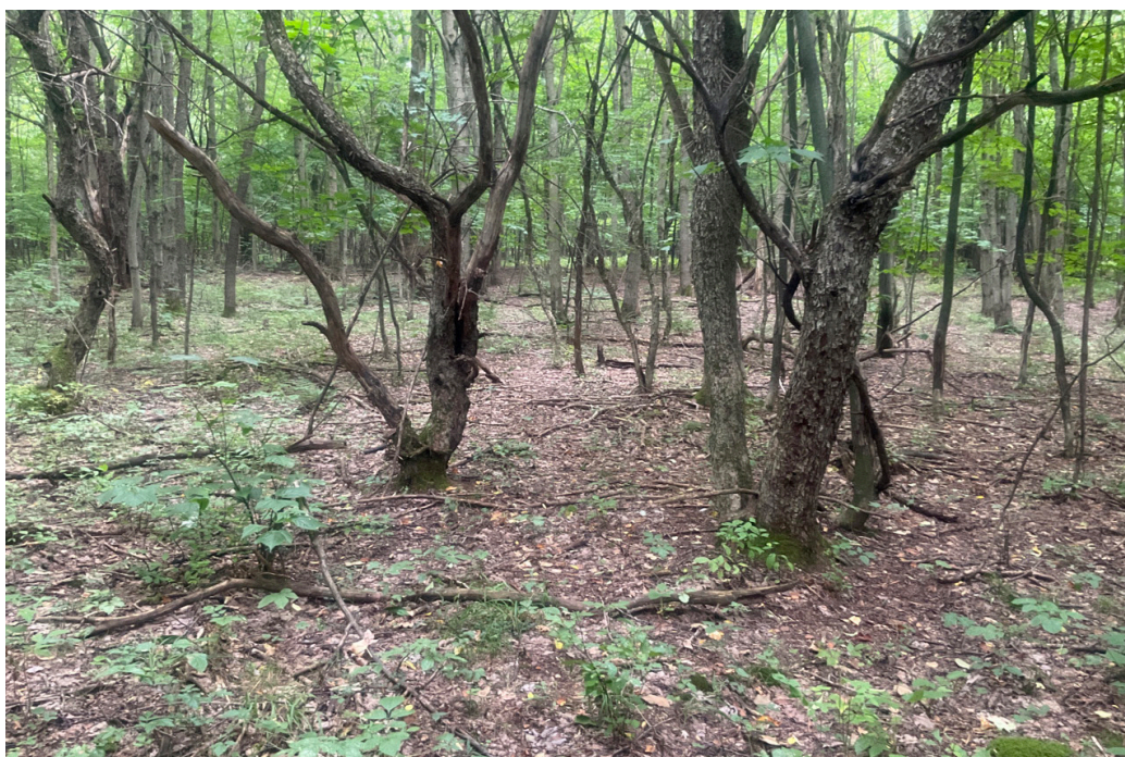
Photo 22 View of forest habitat within sampling hexagon F.