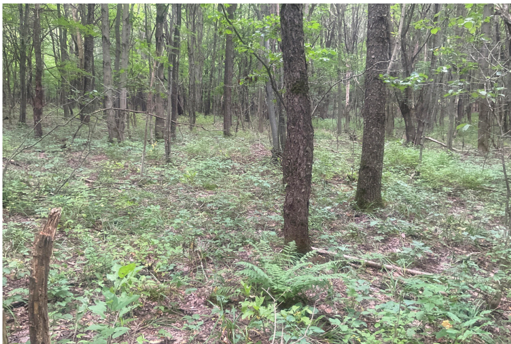
Photo 21 View of forest habitat within sampling hexagon F.