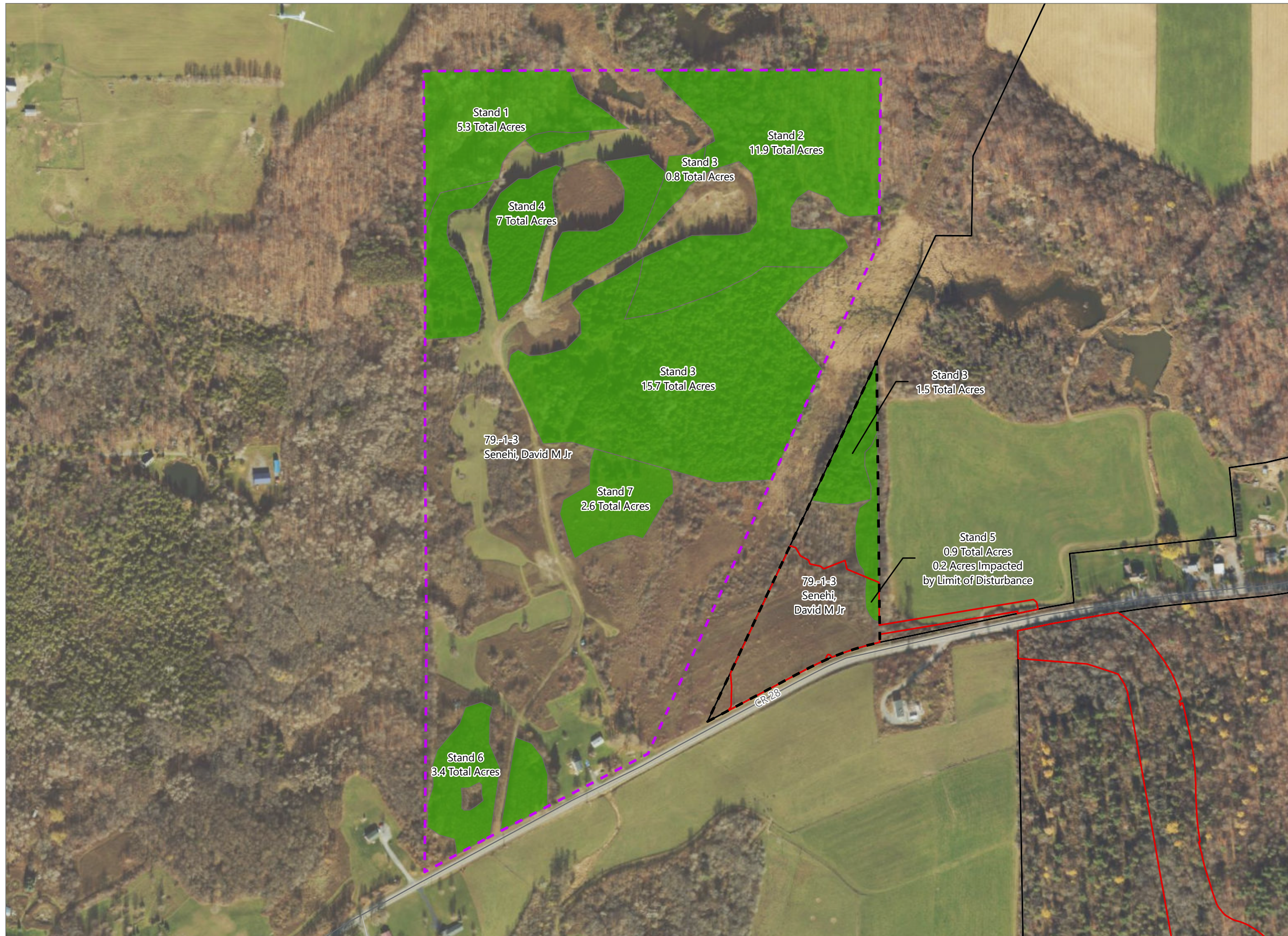
Figure 4-2. Lands Enrolled in 480-a Forest Tax Law Program